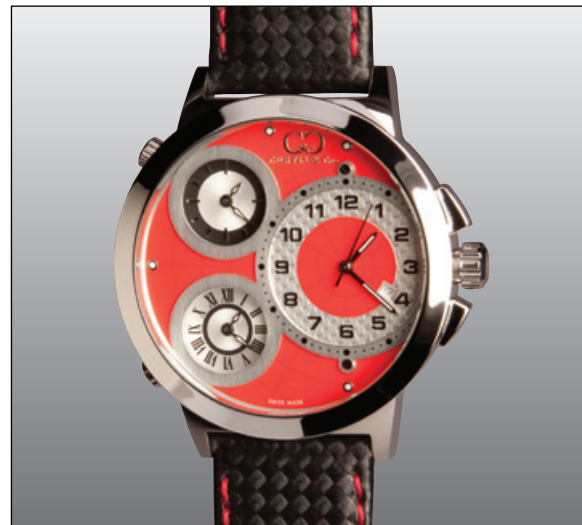
Red :: Stainless Steel W50R-S