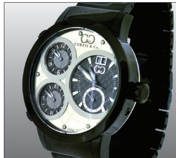
White Carbon Fiber :: Black Case SW4W-B