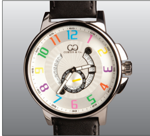
White :: Stainless Steel Case HHW/CN-S