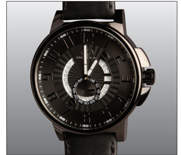
Black :: Black Case HHBK-B