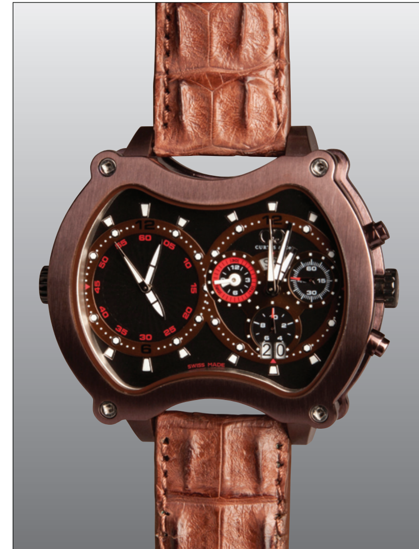
Brown IPU Case GDBK-BR