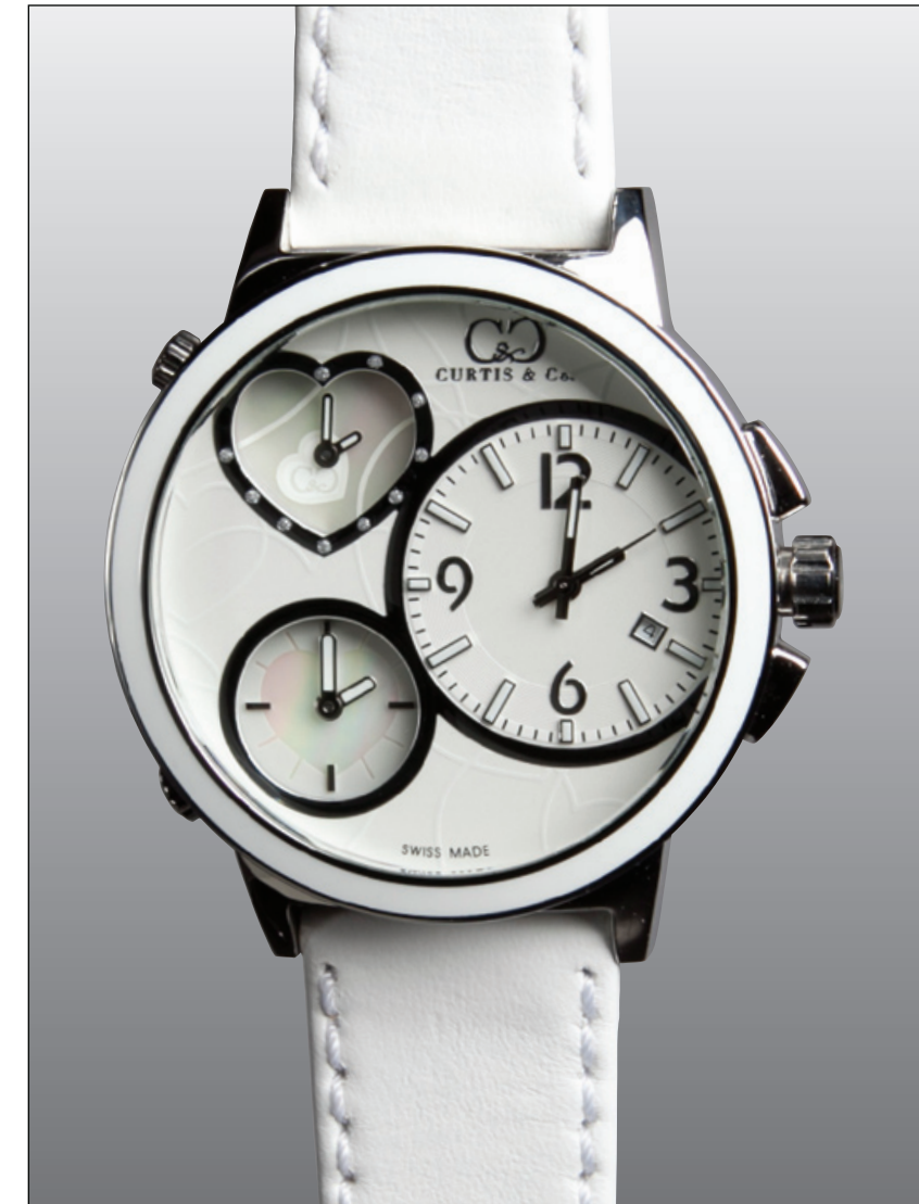
White :: Stainless Steel Case LVW-S