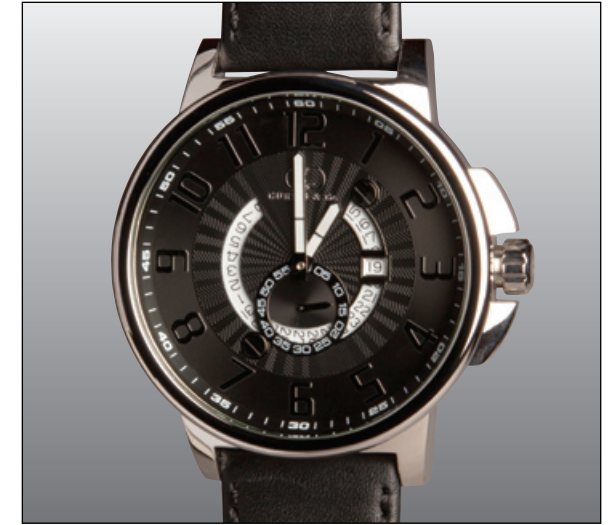
Black :: Stainless Steel Case HHBK-S