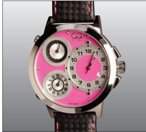
Pink :: Stainless Steel W50PK-S