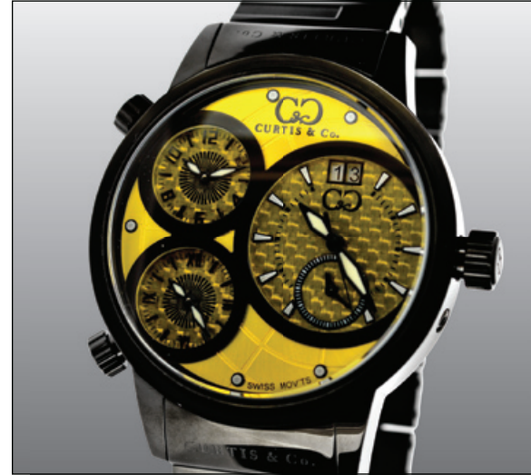
Yellow Carbon Fiber :: Black Case SW4Y-B