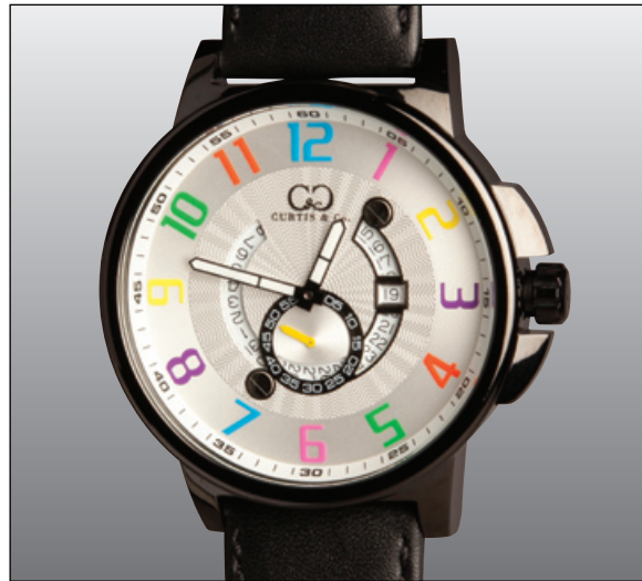
White :: Black Case HHW/CN-B