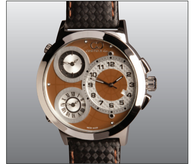
Brown :: Stainless Steel Case W50BR-S