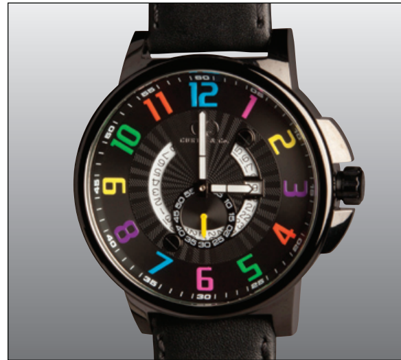
Black :: Black Case HHBK/CN-B