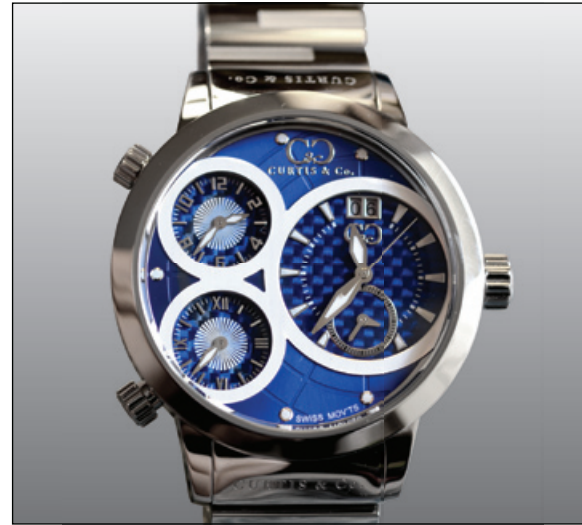
Blue Carbon Fiber :: Stainless Steel Case SW4BL-S