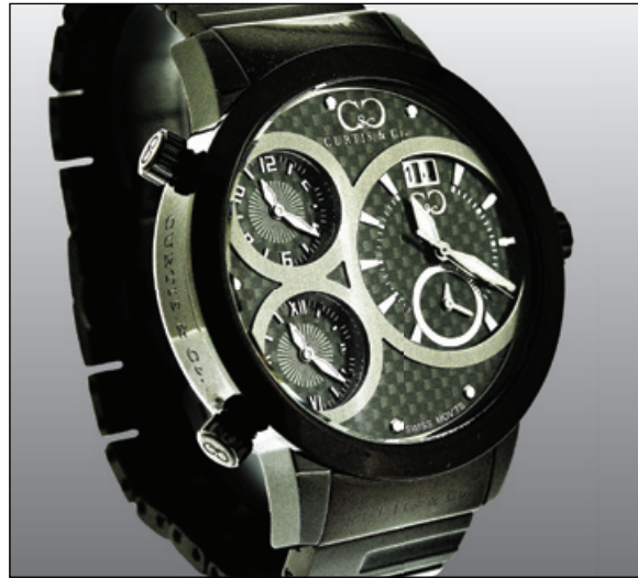
Black Carbon Fiber :: Black Case SW4BK-B