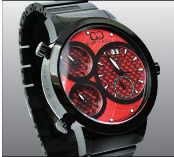
Red Carbon Fiber :: Black Case SW4R-B