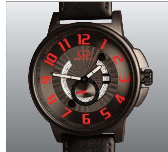
Black :: Black Case HHBK/RN-B