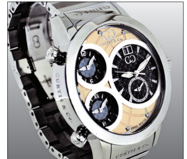
Rose Gold Carbon Fiber :: Stainless Steel SW4RG-S