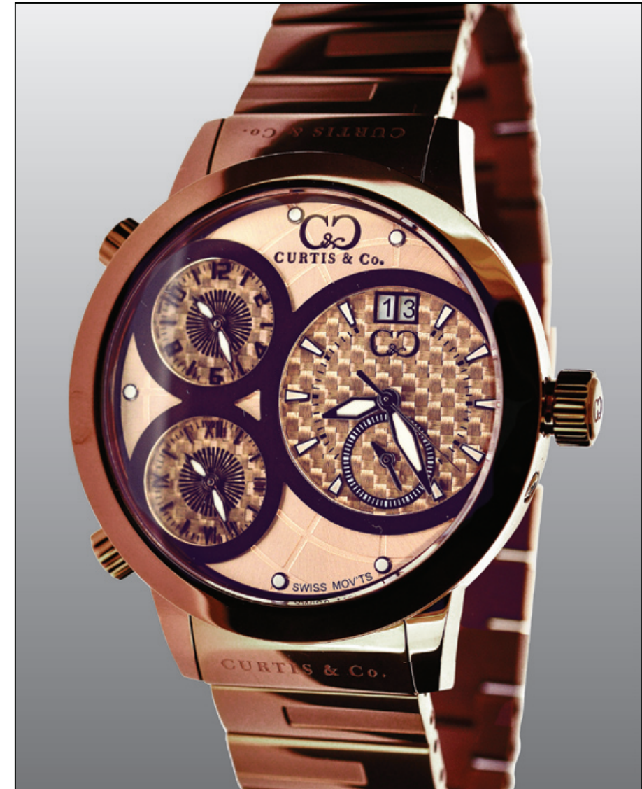
Rose Gold Carbon Fiber :: Brown Case SW4RG-BR