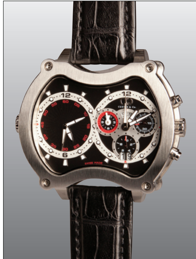
Stainless Steel Case GDBK-S