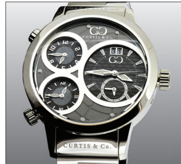
Gray Carbon Fiber :: Stainless Steel SW4GY-S