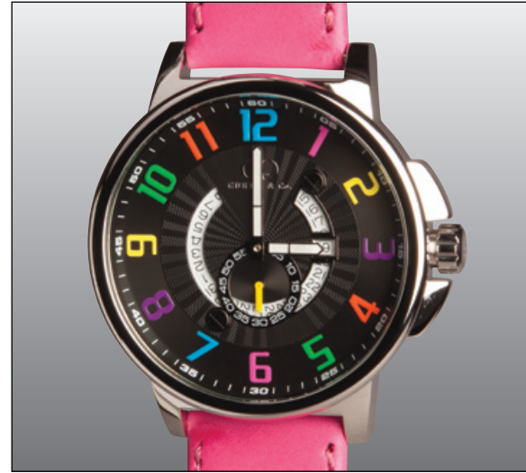
Black :: Stainless Steel Case HHBK/CN-S