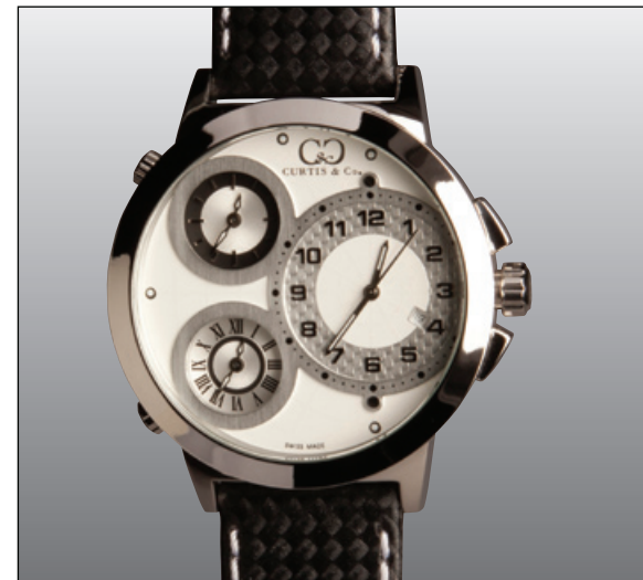
White :: Stainless Steel W50W-S