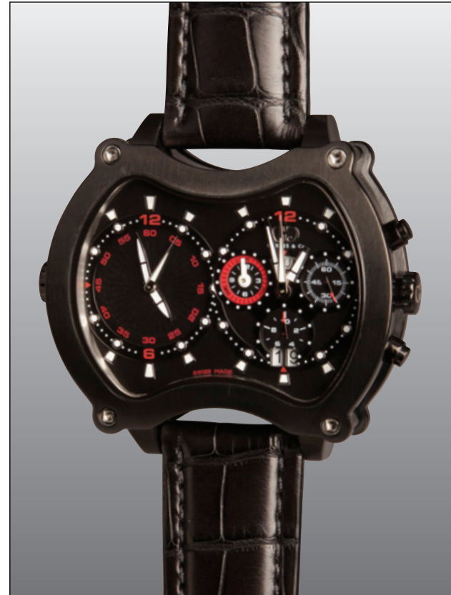
Black IPU Case GDBK-B