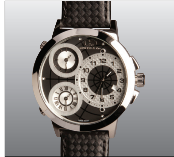
Black :: Stainless Steel Case W50BK-S