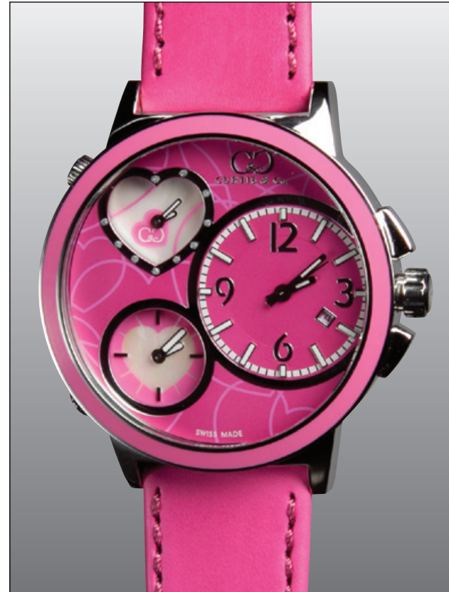
Pink :: Stainless Steel Case LVPK-S