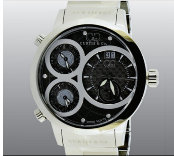
Black Carbon Fiber :: Stainless Steel Case SW4BK-S