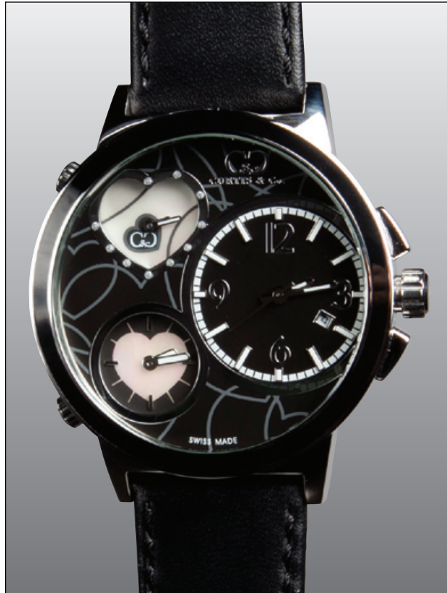
Black :: Stainless Steel Case LVBK-S