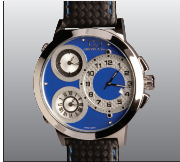
Blue :: Stainless Steel W50BL-S