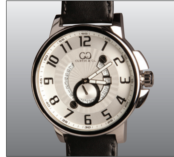
White :: Stainless Steel Case HHW-S